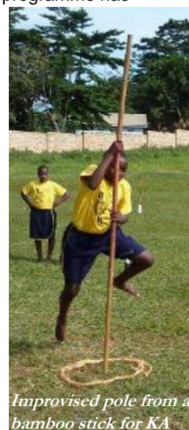
Improvised pole from a bamboo stick for KA

Last but not least, the Kids' Athletics programme has even been included in the plan of action of the Federation for education and talent identification.