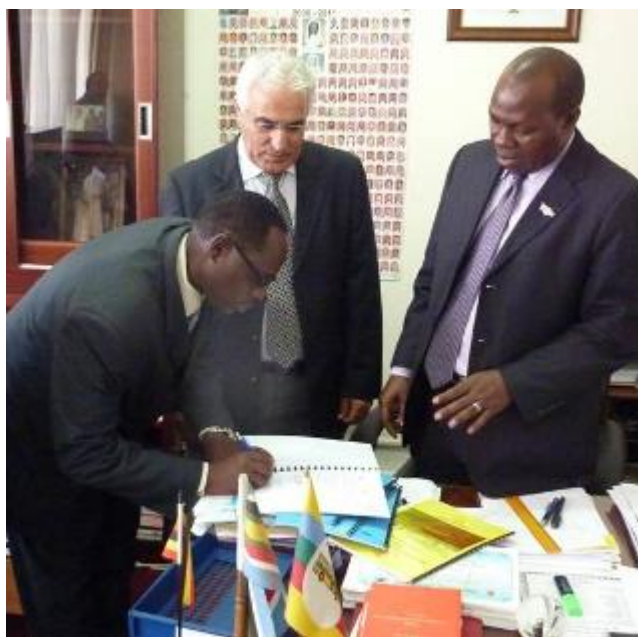
The UAF President signing the Convention in the presence of the Minister of Education and Sports

ics exhibition for 48 kids. The newly trained lecturers should now start to train PE Teachers, who will be in charge to roll out the KA programme in all the schools of the provinces.