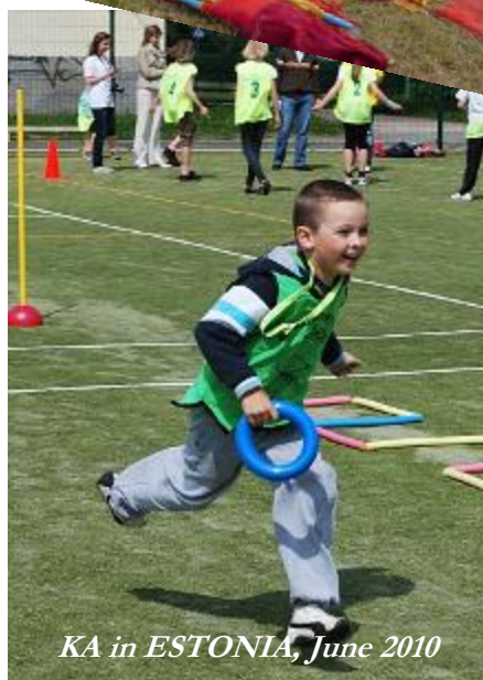
KA in ESTONIA, June 2010

For further information regarding this newsletter, please contact: