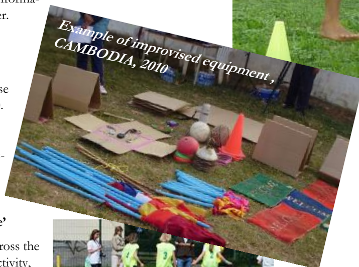
Example of improvised equipment, CAMBODIA, 2010