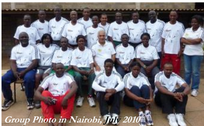
Group Photo in Nairobi, July 2010