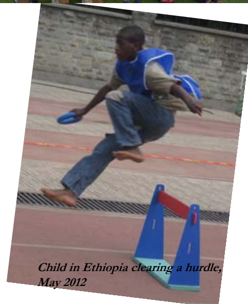
Child in Ethiopia clearing a hurdle, May 2012