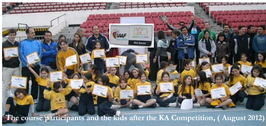
The course participants and the kids after the KA Competition, ( August 2012)