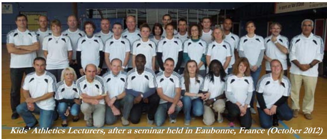
Kids' Athletics Lecturers, after a seminar held in Eaubonne, France (October 2012)

In the frame of the Memorandum of Understanding signed between the French Athletics Federation and the IAAF, and thanks to the sponsor of Nestlé Healthy Kids, a Seminar on Kids' Athletics has been