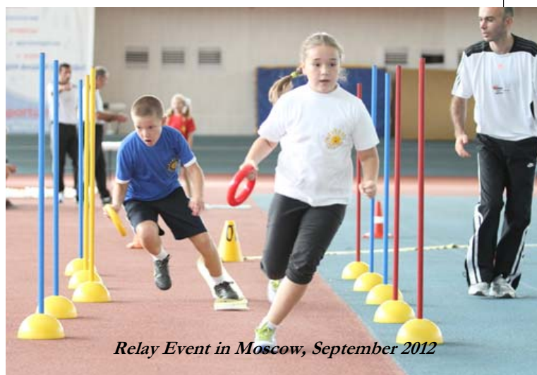
Relay Event in Moscow, September 2012

For further information regarding this newsletter, please contact: