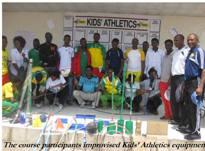
The course participants improvised Kids' Athletics equipment