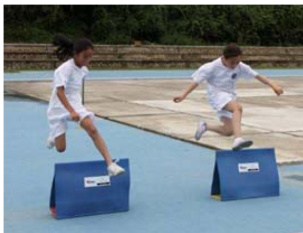
Kids taking part in the Sprint hurdles event (Thimphu, 2 September 2012)

dent and the General Secretary of the National Federation. The head of school sports also attended the course.