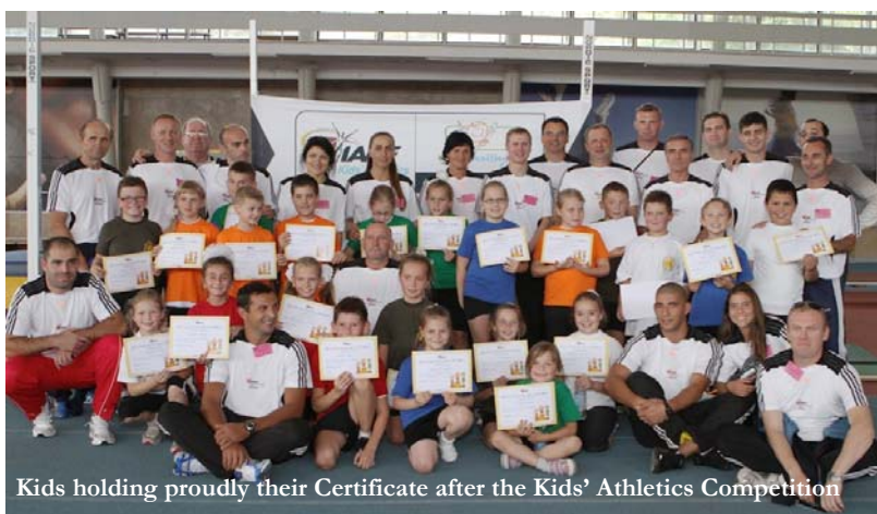
Kids holding proudly their Certificate after the Kids’ Athletics Competition

ment of the program “Athletics at School” in their countries.