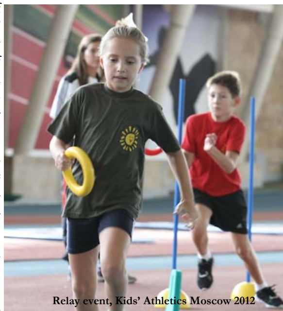
Relay event, Kids’ Athletics Moscow 2012

Participants have been given the task to create new educational cards for different athletic events on the model of the existing IAAF Educational Cards and to organize a practical session using these new cards. On the last day of the Seminar, participants delivered presentations of their projects based on the develop-