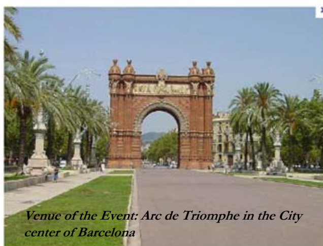
Venue of the Event: Arc de Triomphe in the City center of Barcelona

“Our task remains to inspire young people around the world and give them the support and encouragement they need to become healthy of body and mind and also to be inspired to compete at club, national or international level. Our sport, at all levels of participation, offers a firm foundation of skills and values for living which are just as appropriate to youngsters in 2012 as they were to the youth of 1912”.