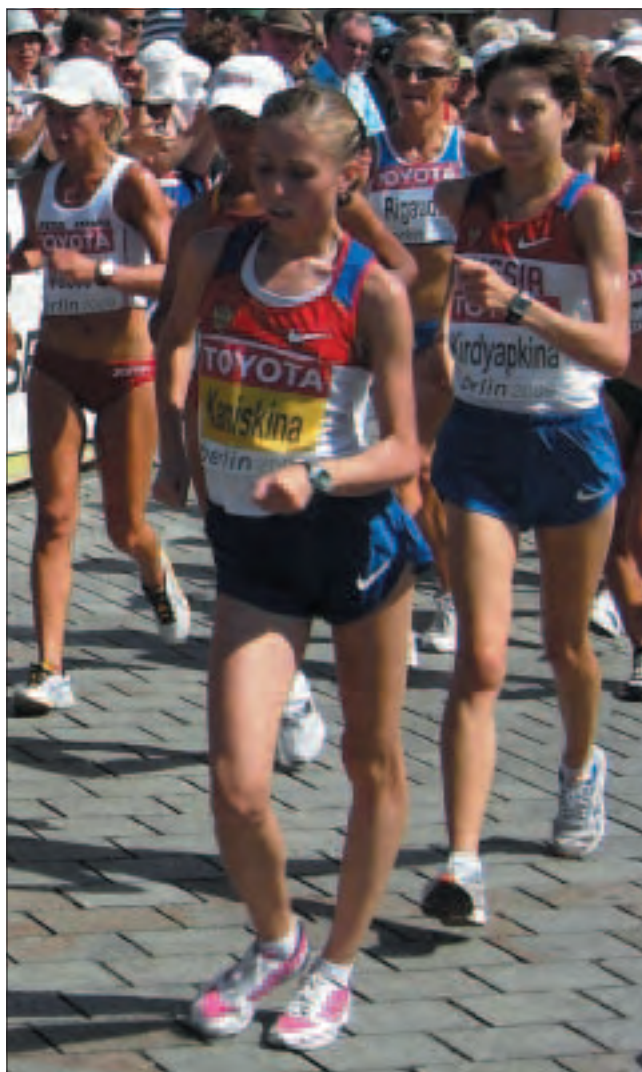
Olga Kaniskina (Russia), Olympic champion 2008, World champion 2007-2009.

help to improve standards of judging, thereby improving walking competitions and the sport of race walking around the world.