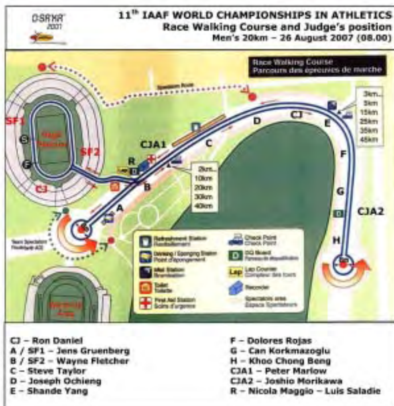
IAAF World Championships, Osaka 2007. Map of the circuit and road judging position