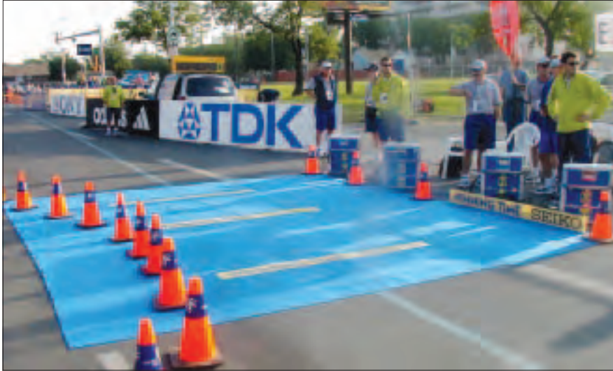
Mat for Transponder System.

calculated team results printout should be part of the results summary. In Race Walking Cup competitions, team scoring is as follows (Competition regulation 717.5, approved by IAAF Council in June 1998):