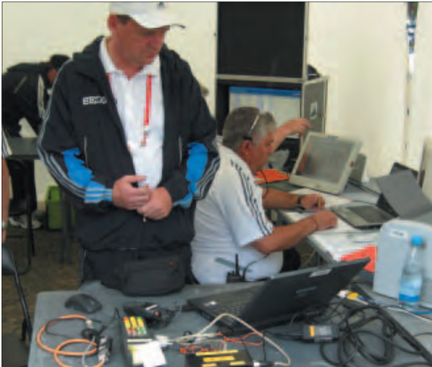
Recorders area at the IAAF World Championships - Berlin, 2009

The Judging Summary sheet is the official score sheet of the judging of the race. ACCURACY IS ESSENTIAL. At the end of the race, the individual Judges' record cards are collected and all the cautions and red cards are added to the Judging Summary Sheet. It is important to indicate the time that each red card was issued and where applicable the time that any competitor was disqualified. The Judging Panel should receive a copy of the Judging Summary Sheet. In addition the Summary Sheet should be distributed to other relevant people such as Technical Delegate, LOC, Media through the TIC.