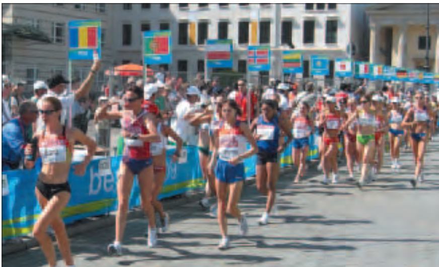
Refreshment Area at the World Championship in athletic, Berlin 2009.

ers can then simply swing by the tables and seize the cups. Attendants keep the cups full and remove discarded cups from the course. A large trash barrel should be used to dispose of used cups. The best arrangement for the sponging station(s) is to have medium size sponges taken from large buckets of water by attendants and placed on tables approximately 1 metre high for easy reach by the walkers.