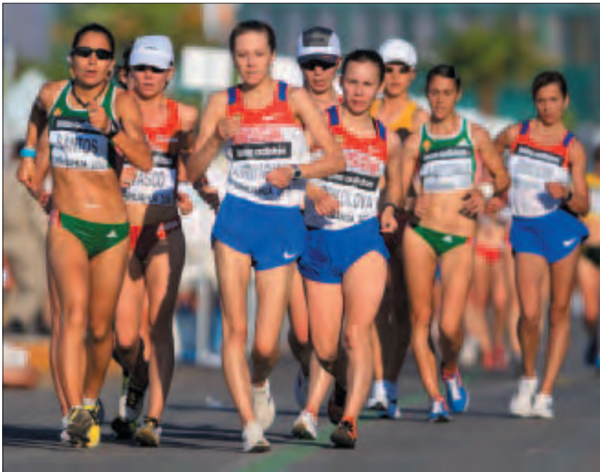
Women's 20kms IAAF World Cup 2010.