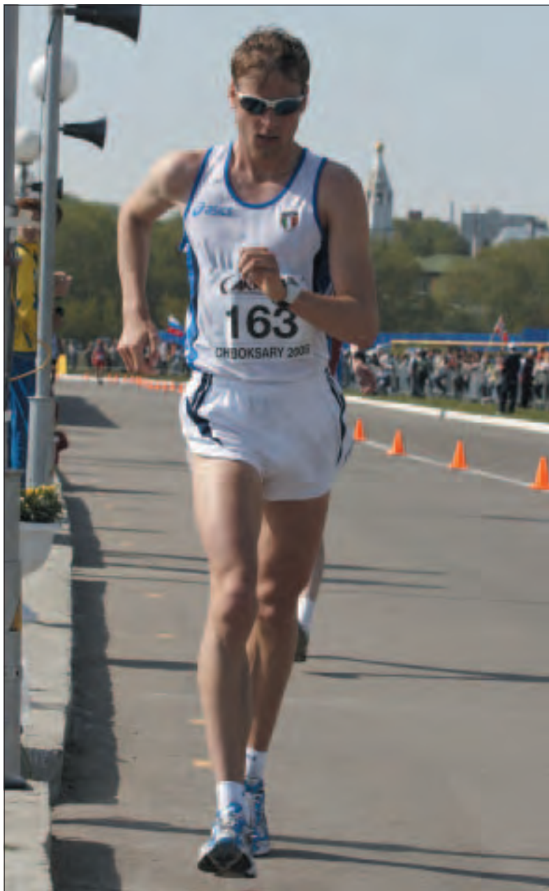
Alex Schwazer (Italy), Olympic champion 2008