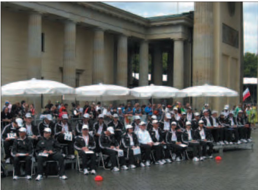
Lap counters officials at the World Championship, Berlin 2009.

These people will be responsible for the operation of the Posting Board during