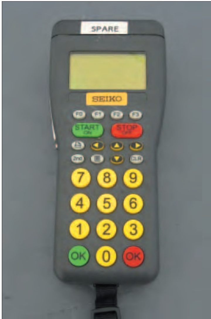
Judges' hand-held terminal.