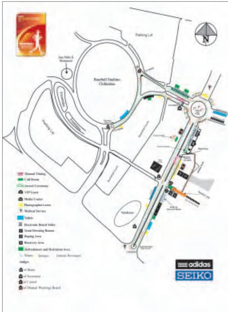
Map of the IAAF Race Walking Circuit IAAF Race Walking Cup, Chihuahua 2010.