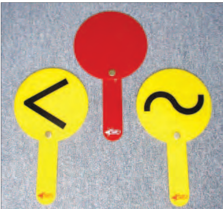
Yellow caution paddles and Red disqualification paddle.