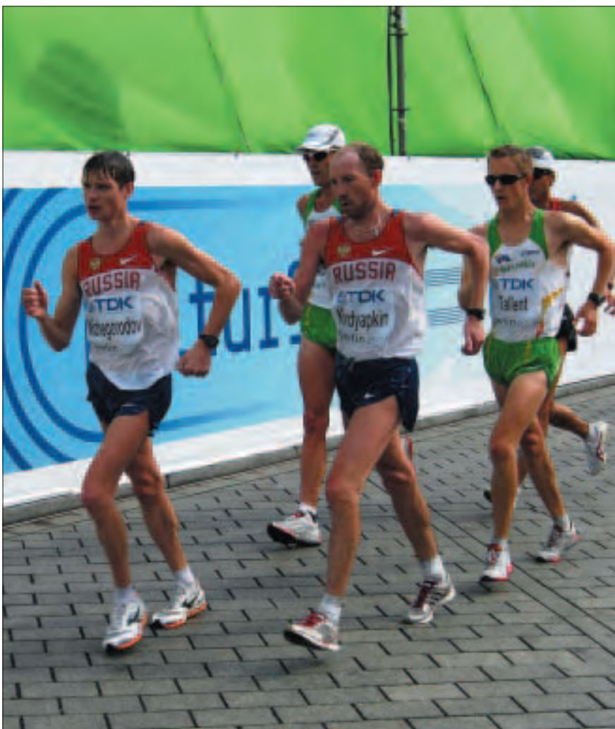
Leading group in the Men's 50kms at the IAAF World Championships - Berlin 2009.