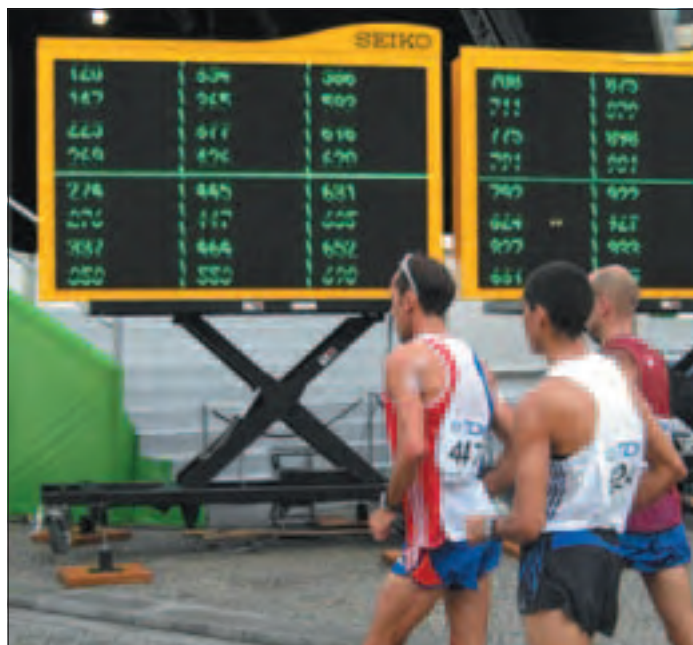
Posting Board: Manual and electronic, Berlin 2009.