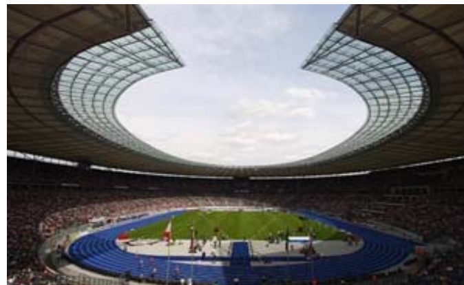
A packed Berlin Olympic Stadium - 2009 AF Golden League

205 of the 213 IAAF Member Federations have declared their intention to participate at the 12th IAAF World Championships in Athletics, Berlin, Germany (15–23 Aug 2009) READ MORE