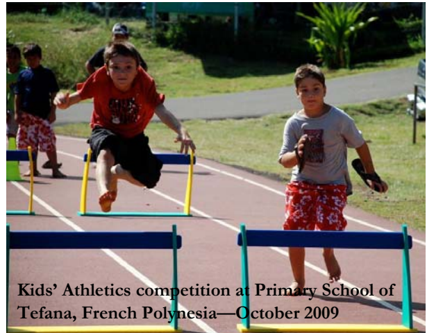
Kids' Athletics competition at Primary School of Tefana, French Polynesia—October 2009

The Bolivian Athletics Federation has approached the Ministry of Education and discussed the possibility to sign an agreement between the IAAF and the Bolivian government. For the coming months, the Federation is coordinating with the Education Minister to run Kid Athletics courses for P.E. teachers in the nine departments (regions) of the country and the agreement will be very valuable to sustain the project. To be continued.