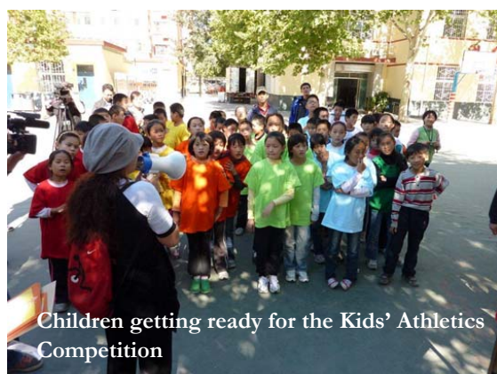
Children getting ready for the Kids' Athletics Competition

at the Sport Scientific Forum of Beijing Sport University with sound lecturing facilities. The Seminar has been live broadcasted on the web, and could be accessed worldwide simultaneously. It is the first time that RDC Beijing and BSU jointly live broadcast an IAAF activity on the internet. The practical sessions were conducted in the well-equipped indoor and outdoor tracks of Beijing Sport University, with adapted implements and facilities. RDC Beijing also provided several volunteers for the seminar organisation which facilitated the smooth running of the practical sessions to introduce the new equipment for the 13-15 age group. A KA demonstrative competition involving local primary school pupils was also carried out at the end of the seminar.