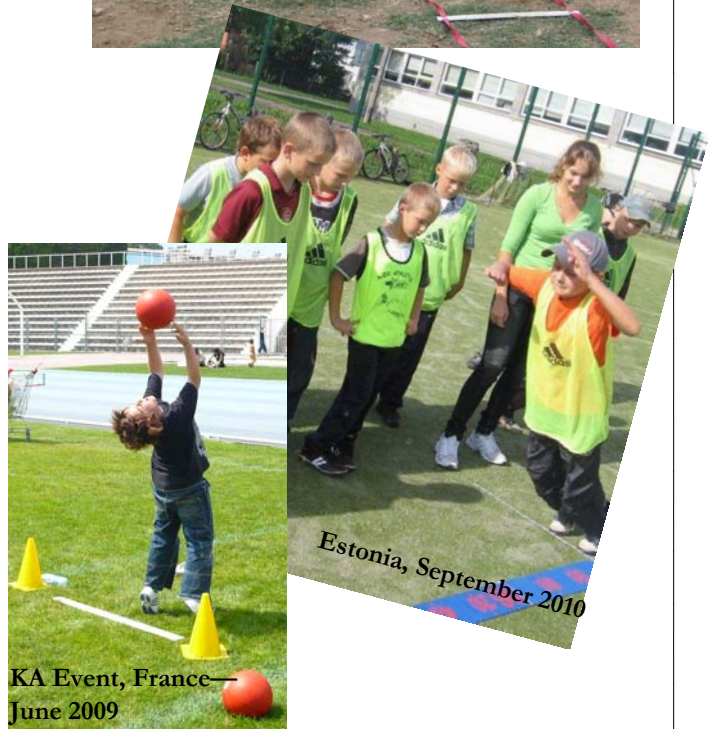
KA Event, France—June 2009