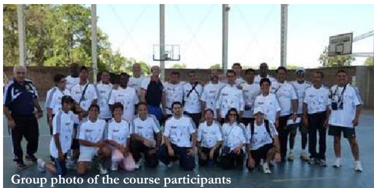
Group photo of the course participants

In the spirit of the Athletics' World Plan , the IAAF has implemented a development programme for clubs but more particularly for schools. Initiated in October 2008, a series of Pilot Projects specifically intended for schools were launched in the various IAAF Areas and South America has just jumped on the train.