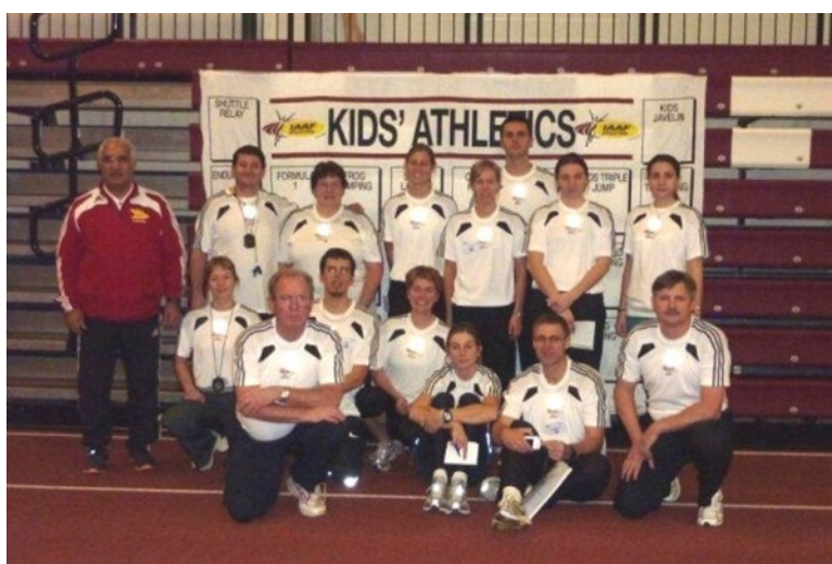
Participants to the Lecturers Course in Tallinn, December 2010.

Of course, they received the required educational material (in electronic format as well as books and brochures) and have now all the keys to implement the School and Youth Programme successfully.