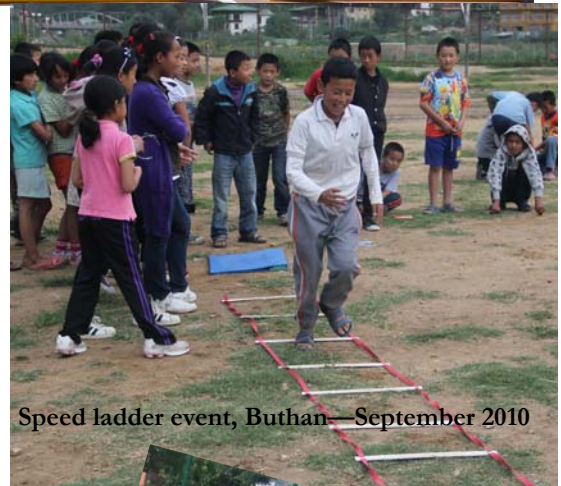
Speed ladder event, Buthan—September 2010