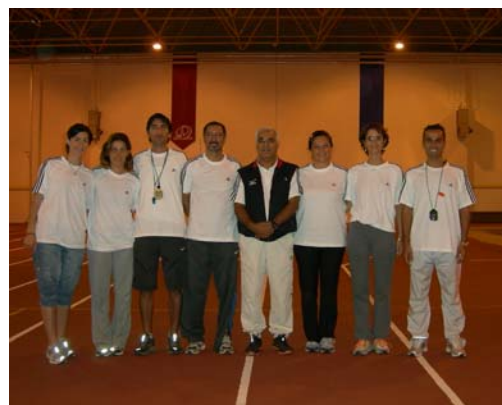
CECS Level I Lecturers Course participants—Eskisehir University of Turkey

In addition, the Turkish Athletic Federation aims to establish direct relation between Physical Education in schools and Sports in 3 Turkish Universities and the IAAF: they all strive for the development of sports and education, and the necessity to increase the number of qualified coaches.