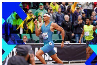
Norman reigns in fierce 400m clash with record run in Eugene