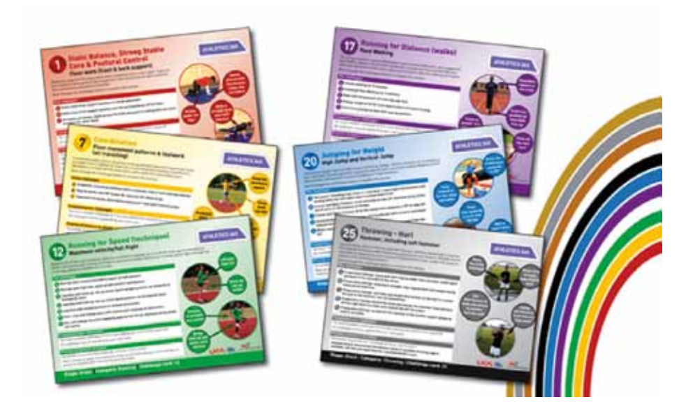
Figure 1: Technical coaching task cards and example game cards

This pack provides technical coaching task cards and example game cards to help coaches and teachers deliver Athletics 365. Each technical coaching task card highlights the key coaching points to ensure that every athlete is able to develop their full potential.