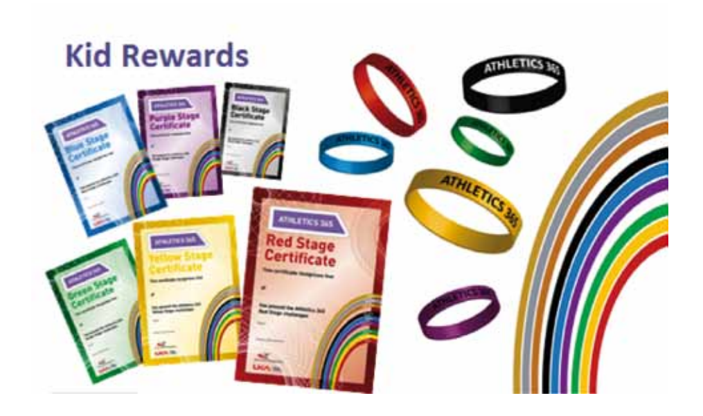
Figure 2: Athletics 365 certificates and wristband rewards

Based on the needs of the coaches, clubs and young athletes the Athletics 365 support resources will be developed further in the future. Current plans include the creation of an Athletics 365 smart phone application.