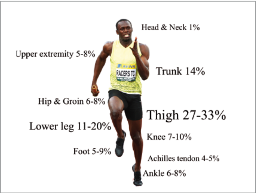
Figure 2: Injury location in male athletes during IAAF World Championships in Athletics