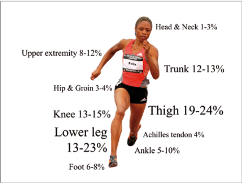
Figure 1: Injury location in female athletes during IAAF World Championships in Athletics